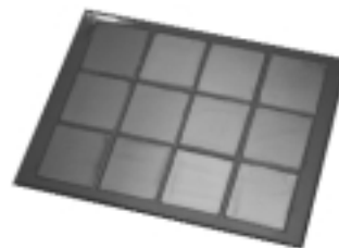
Figure 3: Mosaic concept - 12 BDD/Si electrodes of 6*6 cm 2 on 21*30 cm 2 stainless steel support.

But even the electrode surfaces in the larger DiaCell® 200 are too limited to have a real impact on the industrial market. In order to go ahead with this limitation, CSEM developed a mosaic concept. The mosaic electrode consists of an assembly of many small BDD/Si electrodes joined by a specific polymer layer to protect the metallic support (stainless steel) (Fig. 3).