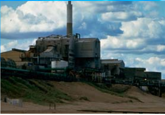
Industrial wastewater treatment

Innovative solutions for water treatment without chemistry